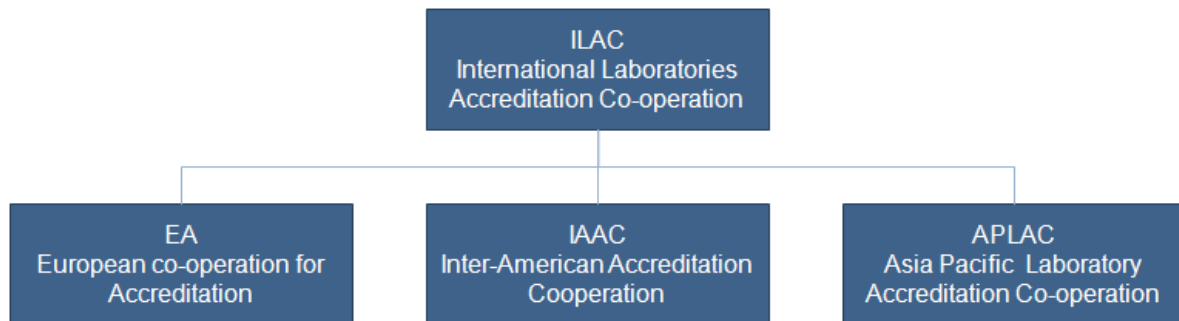
Figure I - ILAC structure